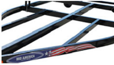
reinforced front and stern